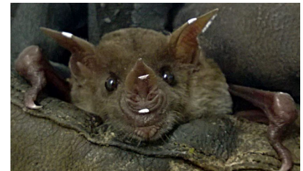
A pale spear-nosed bat ( Phyllostomus discolor).