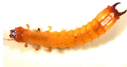
Fire-coloured beetle, Dendroides canadensis, larva.