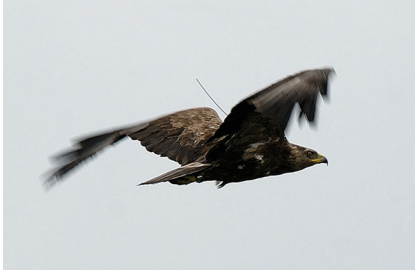
Lesser spotted eagle flying with GPS transmitter.

Although the lesser spotted eagle is not listed as endangered by the IUCN, Bernd-Ulrich Meyburg from BirdLife Germany (NABU) knows that the graceful bird of prey's future is far from assured in Germany. Meyburg explains that the German population has dwindled to just 110 breeding pairs in recent decades, largely due to habitat loss and persecution by poachers during their long migration to their overwintering sites in southern Africa. In a bid to stem the destruction of the German population, Meyburg has been relocating chicks from the more stable Latvian population in the hope of boosting the declining German numbers. However, it was not clear whether the translocated chicks would survive the gruelling migration to their overwintering sites in southern Africa. To be convinced that the conservation strategy might offer hope for the German population, Meyburg needed evidence that the translocated Latvian chicks could somehow reach South Africa and return successfully.