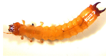
Fire-coloured beetle, Dendroides canadensis, larva.