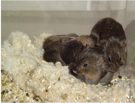
Social prairie voles.