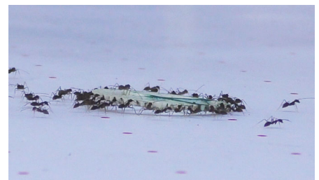
Cooperative ants transporting a CD.