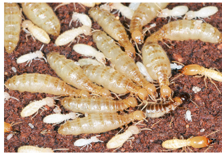
King and queen termites.