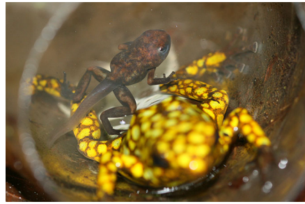
Little devil poison frog and froglet, Oophaga sylvatica.