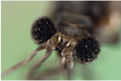
Close-up of the eyes of a male Xenos peckii .

When Xenos peckii twisted-wing parasite males emerge as adults from within the body of the hapless wasp that served as their incubator, the race is on. With an adult lifetime spanning just a few hours, the male insects have to locate a female and mate before their time is up. And the challenge of locating a female mate – which is barely more than a fleshy bag of eggs with no eyes or limbs – is particularly problematic. Concealed within the body of her own host, only the female's head and mating channel protrude from the surface.