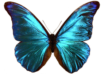
Morpho rhetenor . Photo credit: Marco Giraldo.

For centuries, Renaissance artists pursued the most opulent pigments for their wealthy patrons, and lapis-lazuli-based ultramarine blue was the rarest and most prized of all. Although the lack of natural blue pigments has not hampered some species from decking themselves out in opulent azure tones, the exotic blue shades sported by animals ranging from kingfishers to Morpho butterflies share more in common with the iridescent colours of an oily film than the masterpieces of Vermeer.