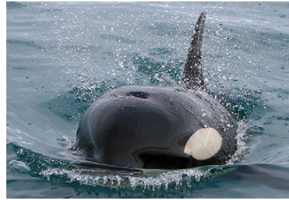
A killer whale surfacing.