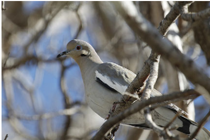
A white-winged dove in southern New Mexico, USA.