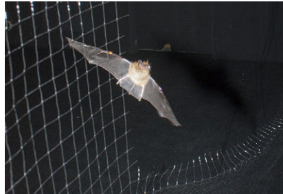
Big brown bat negotiating net obstacle.

Bats are the ultimate evolutionary opportunists. To cash in on the bonanza of insects that take to the air after dark, the mammals have developed agile flight and a unique echolocation system to locate fast-moving bugs in the dark. However, Benjamin Falk from Johns Hopkins University, USA, explains that although bat flight and echolocation had been studied extensively, they had never been investigated simultaneously: wind tunnels are too noisy to record echolocation calls and the animals' natural movements were too complex to analyse as they flew freely. That was until 3D motion capture technology became available. The sophisticated system allows scientists and Hollywood directors to reproduce complex natural movements for research and the movies. So, when Cynthia Moss acquired 10 motion-tracking cameras while Falk was in her lab at the University of Maryland, USA, the scene was set for him to find out more about how nimble bats coordinate their echolocation calls with flight.