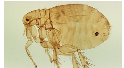
A female Xenopsylla ramesis.