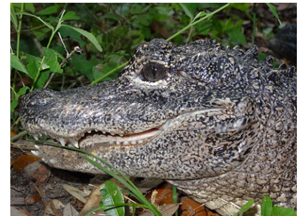
A female Chinese alligator ( Alligator sinensis ).

Once humans master verbal communication, we babble incessantly on any topic under the sun. But even animals that are equipped with less sophisticated communication systems depend on the same resonances that we skilfully shape with our vocal tracts for communication. Stephan Reber from the University of Vienna, Austria, explains that vibrations – produced when air is pushed past the vocal folds – force air trapped in the vocal tract to vibrate (resonate) and it is these resonances that shape bird song and human syllables. Animals also use the frequency of these resonances (how high or low the sound appears) to communicate their body size, with the frequency of a resonance honestly reflecting their size – although some species are known to exaggerate by deepening their resonances. However, no one knew whether reptiles, such as crocodiles and alligators, used resonances to communicate with others. 'Anurans – frogs and toads – do not seem to use them', explains Reber, who decided to find out whether modern day