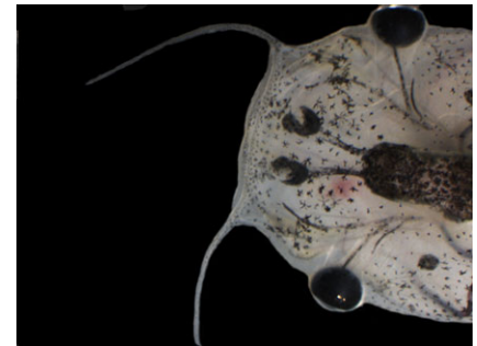
Xenopus laevis tadpole.

Keeping track of the sensory signals generated by the world around us is challenging enough without having to disentangle the nerve signals generated by our own movements. But this is exactly what we would have to do if the neurons that control our every move didn't send simultaneous signals to our sensory systems, telling them to disregard confounding information generated by our own bodies. In addition, these so-called 'corollary discharges' may also contribute to other aspects of behaviour, such as providing stabilisation when senses may be overwhelmed by other inputs. However, unscrambling the impact of corollary signals on movements in the intricate nervous systems of multi-limbed animals is too complex, so Hans Straka and Boris Chagnaud from the Ludwig-Maximilians-University Munich, Germany, decided to focus on a much simpler animal: African clawed frog tadpoles. The nerve signals that control the tail beats of tadpoles and their associated corollary discharges are much simpler to interpret. Reasoning that a pair of touch-sensitive tentacles on the jaws of the tadpoles could be over-stimulated as the tiny swimmers wriggle through the water, Chagnaud, Straka, Sara Hänzi and Roberto Banchi began to investigate how corollary signals from spinal locomotor centres that control swimming might protect the tentacles from sensory overload.