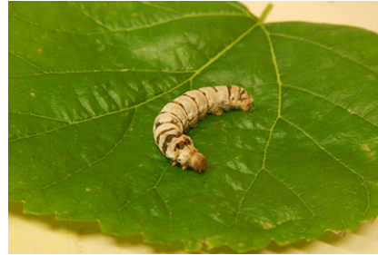
Silk moth larva.

Striking a deal with the environment, ectotherms have come up with a low-cost lifestyle compromise by hitching their body temperature to that of their surroundings. However, as climate change takes a grip and the equilibrium begins shifting, this compromise may come unstuck if conditions become uncomfortably hot. Leigh Boardman and John Terblanche from Stellenbosch University, South Africa, explain that as temperatures rise, aquatic ectotherms are unable to meet the oxygen demands of their warmer bodies, but it wasn't clear whether insects suffered the same fate. Knowing that oxygen availability should alter the thermal tolerance of animals if it is the factor limiting their ability to adapt to hotter conditions, Boardman and Terblanche decided to test the impact of altering the oxygen supply on the metabolism and activity of silk moth larvae and sluggish pupae as the mercury rises.