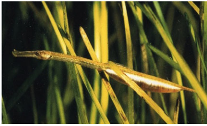
Male pipefish.

Many aquatic species have a reputation for negligent parenting. Having cast their gametes to the currents, they abandon their offspring to their fate. However, hands-on parenting is taken to a whole new dimension in the Syngnathidae fish family. Instead of leaving the responsibility to the females, seahorse and pipefish males take the pledge to care for their young even before the eggs are fertilized. The females depart soon after placing their eggs directly into the male's brood pouch, leaving the soon-to-be fathers to incubate the developing embryos. Ines Braga Goncalves from the University of Zurich, Switzerland, explains that the pregnant males support their offspring by removing the youngsters' waste and supplementing their nutrition, but it wasn't clear whether the males also provided the youngsters with an ample oxygen supply. Braga Goncalves explains that the lower availability of oxygen in water was believed to naturally limit the size of fish eggs and, as pipefish eggs are relatively large for the fish's size, it was assumed that the males somehow provided an abundant supply of oxygen, but no one had checked.