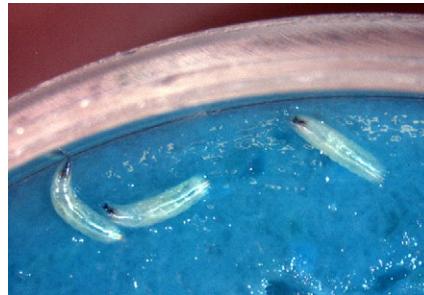
Fruit fly larvae spontaneously join each other in a test dish.