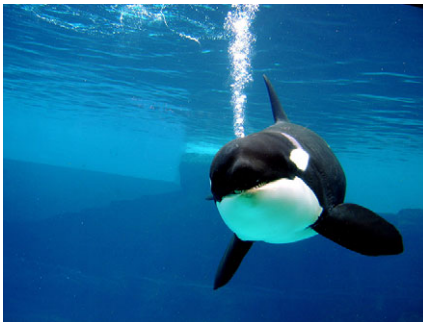
A young male killer whale vocalizing.

If you travel through a country and you have an ear for dialect, you might notice odd words pop up that are particular to the location. Dialects are an occupational hazard of travel, and it turns out that killer whales from different geographical regions have them too. Ann Bowles, from the Hubbs-SeaWorld Research Institute, USA, says, ‘Some mammals have a repertoire of calls that seem specific to particular geographic areas or particular social groups.’ However, why killer whales acquire their dialect is a mystery and discovering the reason is particularly tricky because killer whales form incredibly stable family groups, making it almost impossible to study dialect acquisition. So Bowles turned her attention to six captive killer whales at SeaWorld San Diego, USA. According to Bowles, five of the animals originated from – or had a mother from – the waters surrounding Iceland, while the sixth was from the Pacific Northwest, and all had arrived in San Diego via different routes. Given the animals’ different origins and life experiences, Bowles and her colleagues Jessica Crance and Alan Garver were curious to find out how much overlap there was between the animals’ use of dialect (p. 1229).