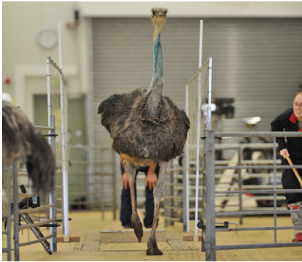
An ostrich jogs over an obstacle runway.