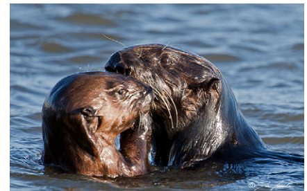
Southern sea otter mum and pup.

Sea otters have voracious appetites, and for good reason. As the smallest marine mammals, they face unprecedented metabolic challenges just to stay warm, consuming a quarter of their own body mass each day. And there are times when the metabolic demands of sea otter females rocket even further. Nicole Thometz, from the University of California at Santa Cruz, USA, explains that in addition to the extra cost of lactation, the mums must also expend additional energy while foraging to sustain themselves and their dependents. However, no one knew the true magnitude of the metabolic burden placed on sea otter mothers: 'neither the energetic demands of immature sea otters nor the cost of lactation for adult females have been quantified', says Thometz. Fortunately, Thometz and her colleagues had access to the world's most successful sea otter pup rehabilitation program at the Monterey Bay Aquarium in California, where they could measure the metabolic rates of wild sea otter pups while they grew, prior to their return to the ocean, to begin to find out how much of a burden motherhood is for sea otter females (p. 2053).