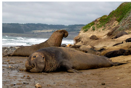
Two adult male elephant seals.