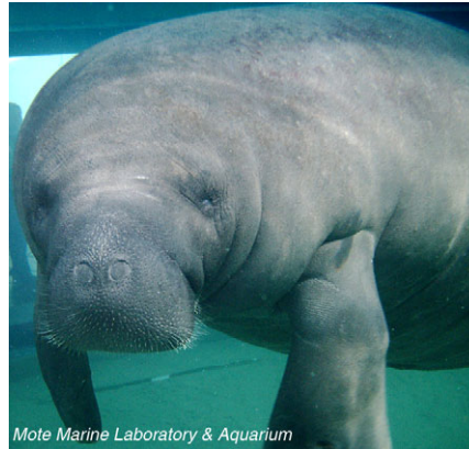
Mote Marine Laboratory & Aquarium

Grazing sea grass along the subtropical Florida coast, manatees would seem to have an idyllic life; that is until a passing motorboat shatters their peace. But motorboats and other watercraft pose an even greater threat, injuring the peaceable mammals with their propellers, or shattering their ribcages and puncturing their lungs in collisions. Joe Gaspard from the Mote Marine Laboratory and Aquarium, USA, explains that it isn't clear why the animals are so vulnerable to human activity. Although their vision is known to be extremely restricted in the turbid water, Gaspard points out that sound is absorbed less in water than in air, potentially allowing it to travel farther. It also travels five times faster in water than in air, theoretically warning the animals earlier of an approaching threat. However, it wasn't clear whether manatees have the ability to hear looming watercraft above the cacophony of their natural environment. Teaming up with Gordon Bauer, Roger Reep and David Mann, and a group of trainers from the aquarium, Gaspard decided to test the hearing of two captive manatees, Buffett and Hugh, to find out what they are capable of hearing (p. 1442).