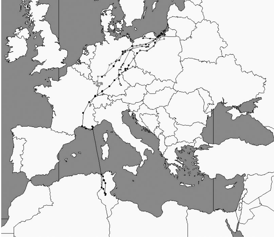
Fig. 2. Map showing the movements of storks released in the Kaliningrad Region in September 2000 and September 2001. Bird # 14554 is the one that crossed the Mediterranean.

and on 26 September near Taucha (Sachsen, Germany). It was finally found dead in Bavaria.