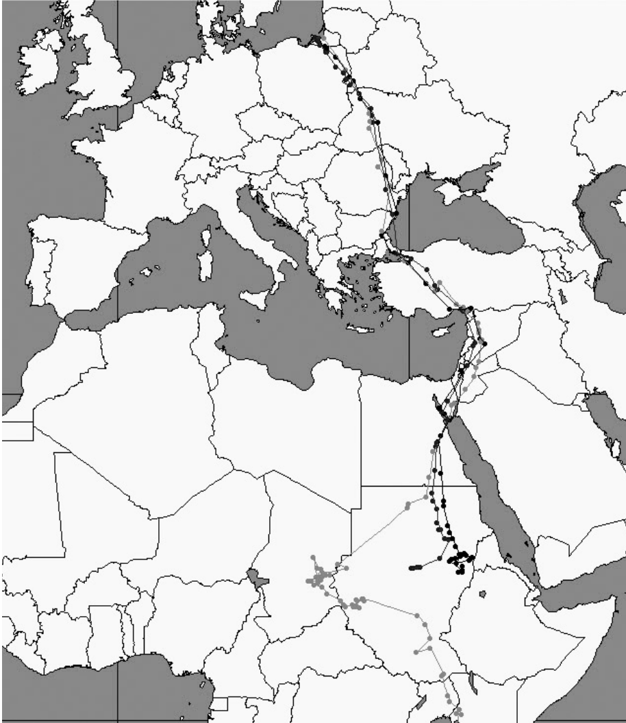
Fig. 1. Map showing the movements of three storks equipped with transmitters in nests in 2000.

were released in two groups in the Omsk Region. One group consisting of four storks (two with transmitters) was released on 4 August 2002 on the coast of Lake Tenis ( 56^{\circ}12' \text{ N} , 72^{\circ}01' \text{ E} ), while the other group (two birds, one with transmitter) was released on 5 August near Ostrovnyaya ( 56^{\circ}23' \text{ N} , 72^{\circ}10' \text{ E} ). Omsk Region lies far to the east of the breeding range of white storks.