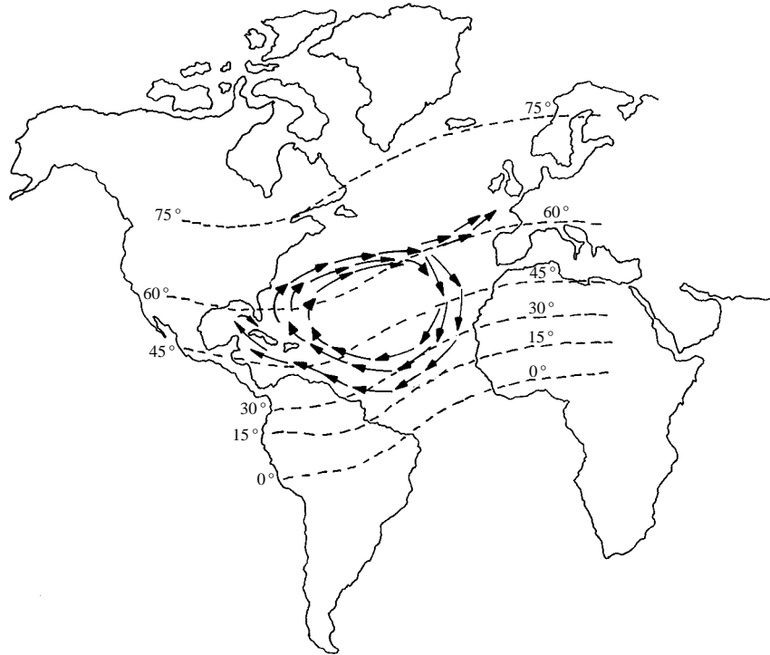
Fig. 3. Diagram of the North Atlantic gyre and inclination angles. Isoclinics (lines of equal inclination) are represented by dashed lines; numbers indicate inclination angles in degrees. Currents of the North Atlantic gyre are represented by arrows, with the North Atlantic Drift branching off from the northeastern corner of the gyre. Isoclinics are adapted from Skiles (1985). North Atlantic gyre is drawn after Gross (1977) and Carr (1986).

hatchlings in the gyre normally swim south when encountering inclination angles marking the northern boundary of the gyre (about 60–67°), they may reduce their chances of being swept north into fatally low temperatures when the Gulf Stream divides.