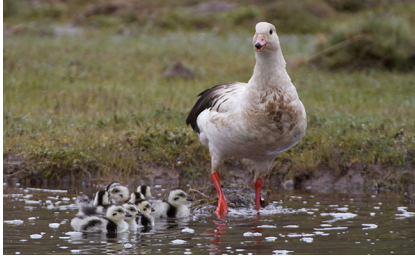
Andean goose and chicks.