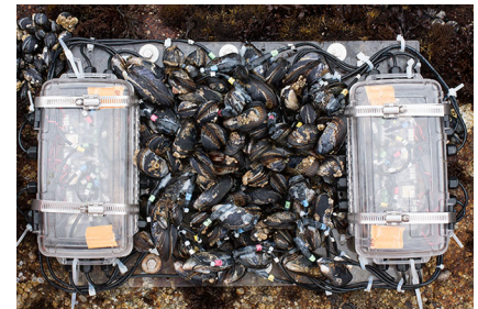
Mussels being monitored on the Central California coast.

As the tide goes out, every mussel clinging to the shore clamps its shell closed in preparation for the rise in temperature as the sun begins beating down. But the conditions encountered by each individual can vary dramatically, even between neighbours hanging onto the same rock. 'Individuals that are just centimetres apart can experience temperatures that are more different than individuals separated by hundreds of kilometres in latitude', says Lani Gleason, from California State University, Sacramento, USA. But what impact might environmental variations within a matter of centimetres have on the animals that experience them directly? Knowing that the temperature that ectothermic (cold blooded) animals experienced in the recent past can radically alter their physiology, Gleason's colleagues, Wesley Dowd, from Washington State University, USA, and Luke Miller, from San Jose State University, USA, decided to compare the responses of mussels