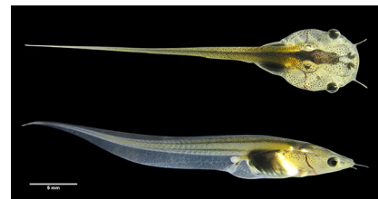
One-month-old Xenopus tadpoles.

Some photographers take advantage of the blurring effect produced when animals and humans move past the lens at high speed to produce extraordinary images, but if animals didn't have a sophisticated system – the optokinetic reflex – to stabilise their vision while mobile, this smeary perspective would be our permanent reality. Céline Gravot, from the Ludwig-Maximilians-Universität München, Germany, explains that most animals swivel their eyes in their heads to counteract the effects of motion: 'You can experience this reflex when looking out of the window of a moving train; your eyes will move to follow the movement of the scene outside', she says. But Gravot and her colleagues Alexander Knorr, Stefan Glasauer and Hans Straka were curious to find out how the swivelling motion of the eye responds to specific features of a scene. For example, would the reflex movement respond in the same way to dark objects – such as a flock of birds or squadron of planes – silhouetted against bright daylight as it does to brilliant stars against a dark sky?