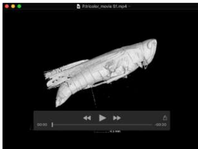
Movie S1. CT scan of respiratory system in P. tricolor .