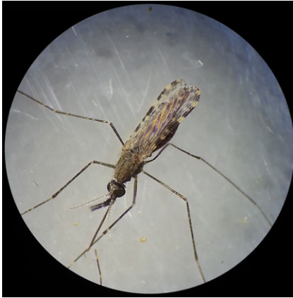
African malaria mosquito, Anopheles gambiae.