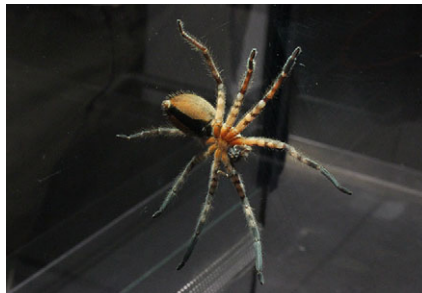
A female Cupiennius salei spider.