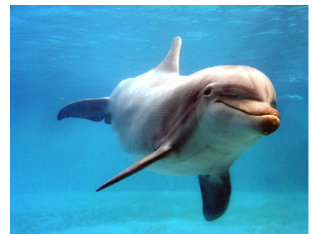
Puka, one of the two dolphins that participated in the study.

When Mr E. F. Thompson stood on a ship cruising through the Indian Ocean in the 1930s and observed a dolphin speed past the vessel in 7 seconds, he had no idea that this single observation would lead Sir James Gray to formulate the enduring paradox that bears Gray's name to this day. Based on Thompson's anecdote, Gray estimated the power required to propel the boisterous mammal through the waves at 20 knots ( 10.3 \text{ m s}^{-1} ) and concluded that the animal did not have enough muscle to pull off the feat. Puzzled by the paradox, Gray suggested that dolphins must use a trick of fluid mechanics to sustain the remarkable performance.