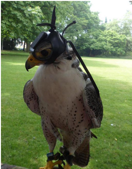
Falcon wearing a hood camera.